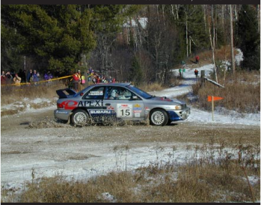
Hadjiminas/Maxwell, Subaru Impreza RS