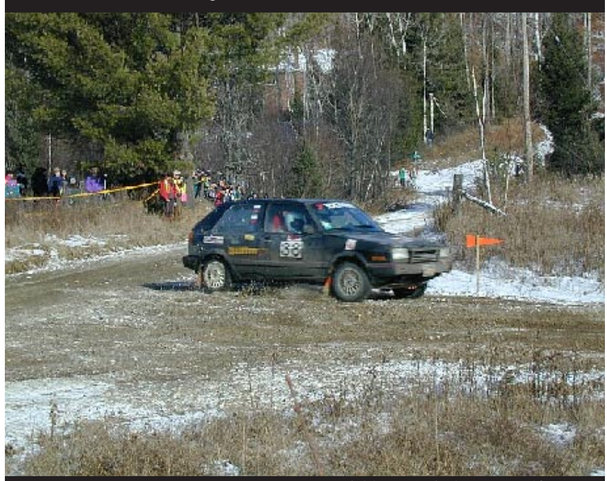
Kishkarev/Wintle, VW Golf AWD