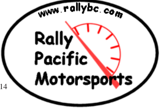
Cover photo of Rocket Rally byPaul MacGregor

Rocket Rally Sweep 3 CARS Rule Changes 4 First Aid Course 5 Tall Pines Photos 6 Thunderbird Rally 8 TSD Rule Changes 12 Schedule 12 Tbird Entry Form 13 Membership, time to renew 14 Rally Legends 16 Strictly Classified 18