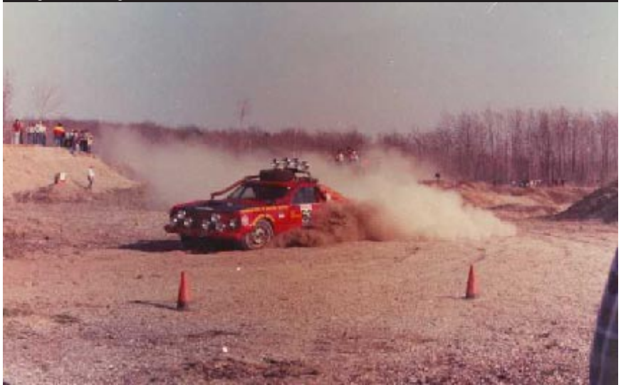
1982 Northern Lights Rally, Houghton Lake, Michigan.

The Buzzard Mobile must have been one of the most unholy rally cars ever created. You see, the Buzzard Boys wanted to go rallying and they had decided to do it in the most bulletproof fashion. After examining the rules, and the contents of the local junkyard, they built up a mid-60's Oldsmobile Toronado. They chose this particular car mostly because of the history of the drivetrain — in Generous Motors literature of the day it was referred to as an offshoot of military vehicle transmission research and was rated as tough enough to be "mil spec". Not content with stock levels of performance, the Buzzard Boys sent the 455 Olds engine to Joe Mondello in California to be "...tuned up just a little, don'tcha know", while the rest of the driveline was beefed by B&M (of drag racing automatic transmission fame). They then went to work on the chassis themselves.