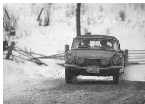
Dave Fairhall, Honda S600, on Mamette Lake Road, TBird 66