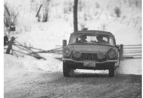
Dave Fairhall, Honda S600, on Mamette Lake Road, TBird 66