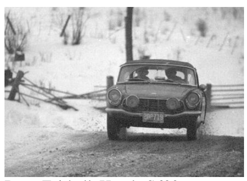
Dave Fairhall, Honda S600, on Mamette Lake Road, TBird 66