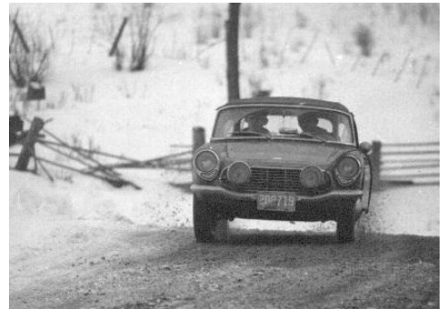
Dave Fairhall, Honda S600, on Mamette Lake Road, TBird 66