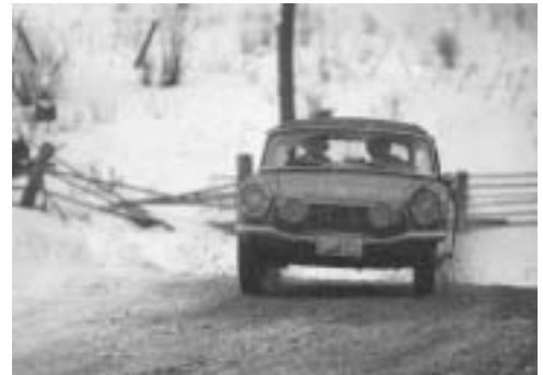
Dave Fairhall, Honda S600, on Mamette Lake Road, TBird 66